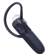
SSM-BT20 Bluetooth® Headset

* Although other commercially available Bluetooth® headsets can be used, the operation of all Bluetooth® products is not guaranteed. We recommend using the Bluetooth® headset SSM-BT20.