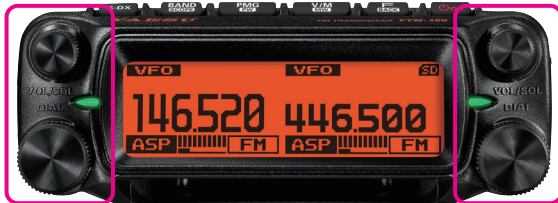
Controls for each band are placed independently on the left and right

Two independent receiver circuits provide true dual-band operation, whether in the same band or in different bands (V+V/U+U/V+U/U+V). In addition, the dial knobs, VOL/SQL knob, and LED indicators for each band are placed independently on the left and right sides of the control head, making it easy to see the status of each band and allowing intuitive operation.