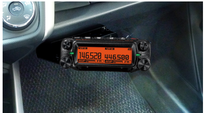
Swing-head kit: SJK-500 (Optional) Installation Image

*Optional control-head extension cable "SCU-62" or "CT-132" is not required.