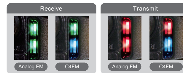
Mode Indicator * C4FM mode is only available in the FTM-3200DR, FTM-3200DE

AMS (Automatic Mode Select) automatically recognizes the received signal as C4FM Digital or conventional FM, and switches the receiver to the appropriate mode. The AMS function enables hassle-free operation by removing the need to manually switch between modes. The MODE indicator shows the Transmit/Receive mode at a glance.