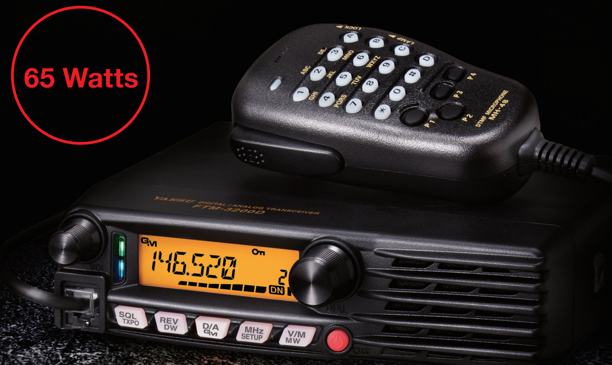
Photo shows the FTM-3200DR/FTM-3200DE