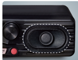
3 Watt (35 x 58mm) Front Speaker

The front facing speaker provides 3 watts of loud audio, The FTM-3200DR/DE, FTM-3100R/E speaker audio has been tuned for even better sound quality. An optional MLS-100 external speaker supports noisy field operation.