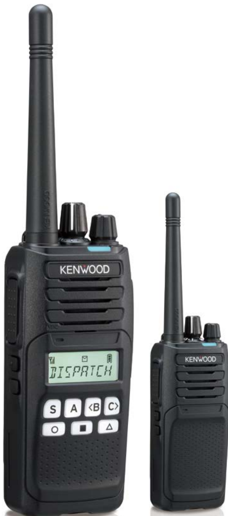
Standard Keypad model

If you are thinking of harnessing the latest digital protocols – NXDN or DMR – to enhance business efficiency or FM analog for its simplicity, the NX-1200/1300 has you covered. Our One-“K”-Fits-All solution offers the widest selection of two-way radios for everyday use. The model matrix also includes basic and keypad variations, with or without a high-contrast backlit LCD. Other features include a 7-color LED indicator and the popular KENWOOD 2-pin audio accessory connector. Plus, mixed-mode operation ensures seamless integration with legacy radios while smoothing the onward migration path to digital. But whatever your specific needs, audio quality is what determines clear voice communications – which is why KENWOOD radios are used under the most grueling conditions, like the cockpit of a racing car. Thanks to our extensive experience with professional systems, reliability is second to none. So whatever your radio requirements, KENWOOD’s NX-1200/1300 offers a single platform that’s right for you.